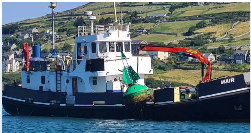
Image has been edited to prevent misrepresentation.